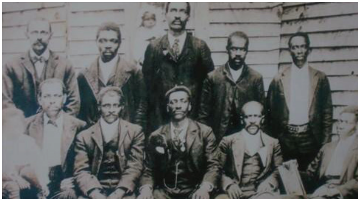
The founders of the Flat Rock community in a photograph c. 1890. Notable descendants include football greats Warren Moon & Willie Gault and comedian Chris Tucker.

Contact: flatrockarchives1865@gmail.com ; (770) 885-8330