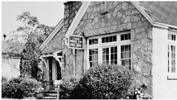
The Lithonia Woman's Club was the area's first lending library. Today, it remains a community landmark and gathering space. Left: Quarrymen "raise a ledge" near Lithonia.