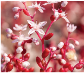
The succulent called diamorpha blankets the mountain with a red carpet in early spring before small white blooms pop.