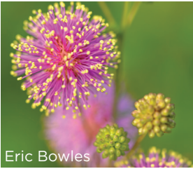
Eric Bowles The "sensitive fern" is one of the many flowers found on the granite outcrops.

@ 4158 Klondike Road, Stonecrest 30038 Open daily, dawn to dusk.