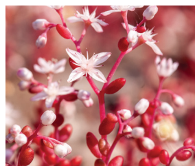
The succulent called diamorpha blankets the mountain with a red carpet in early spring before small white blooms pop.