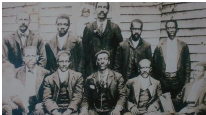
The founders of the Flat Rock community in a photograph c. 1890. Notable descendants include football greats Warren Moon & Willie Gault and comedian Chris Tucker.