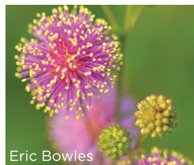
Eric Bowles The "sensitive fern" is one of the many flowers found on the granite outcrops.

@ 4158 Klondike Road, Stonecrest 30038 Open daily, dawn to dusk.