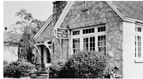
The Lithonia Woman's Club was the area's first lending library. Today, it remains a community landmark and gathering space. Left: Quarrymen "raise a ledge" near Lithonia.