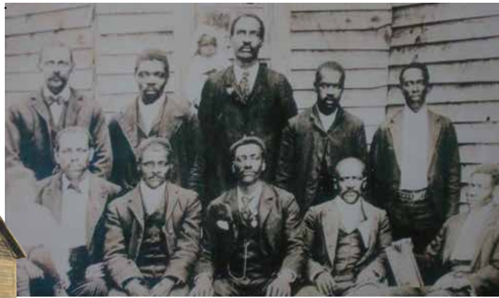
The founders of the Flat Rock community in a photograph c. 1890. Notable decedents include football greats Warren Moon & Willie Gault and comedian Chris Tucker.

Flat Rock Archives @ 3979 Crossvale Road, Lithonia 30038 Open T, Th & Sat 10am-4pm www.flatrockarchives.org