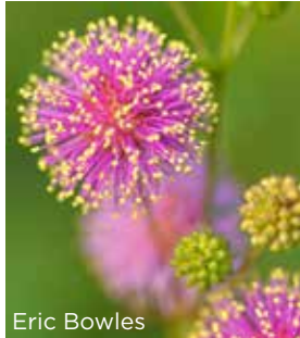
Eric Bowles The "sensitive fern" is one of the many flowers found on the granite outcrops.

Nature Center & Mountain Access @ 3787 Klondike Road, Lithonia 30038 Mountain Base @ 4158 Klondike Road, Lithonia 30038 Open Daily: Dawn to Dusk