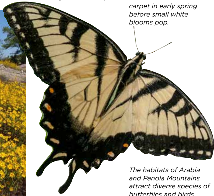
The habitats of Arabia and Panola Mountains attract diverse species of butterflies and birds.