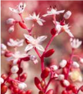
The succulent called diamorpha blankets the mountain with a red carpet in early spring before small white blooms pop.