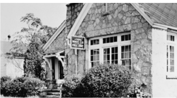
The Lithonia Woman's Club was the area's first lending library. Today, it remains a community landmark and gathering space. Left: Quarrymen "raise a ledge" near Lithonia.