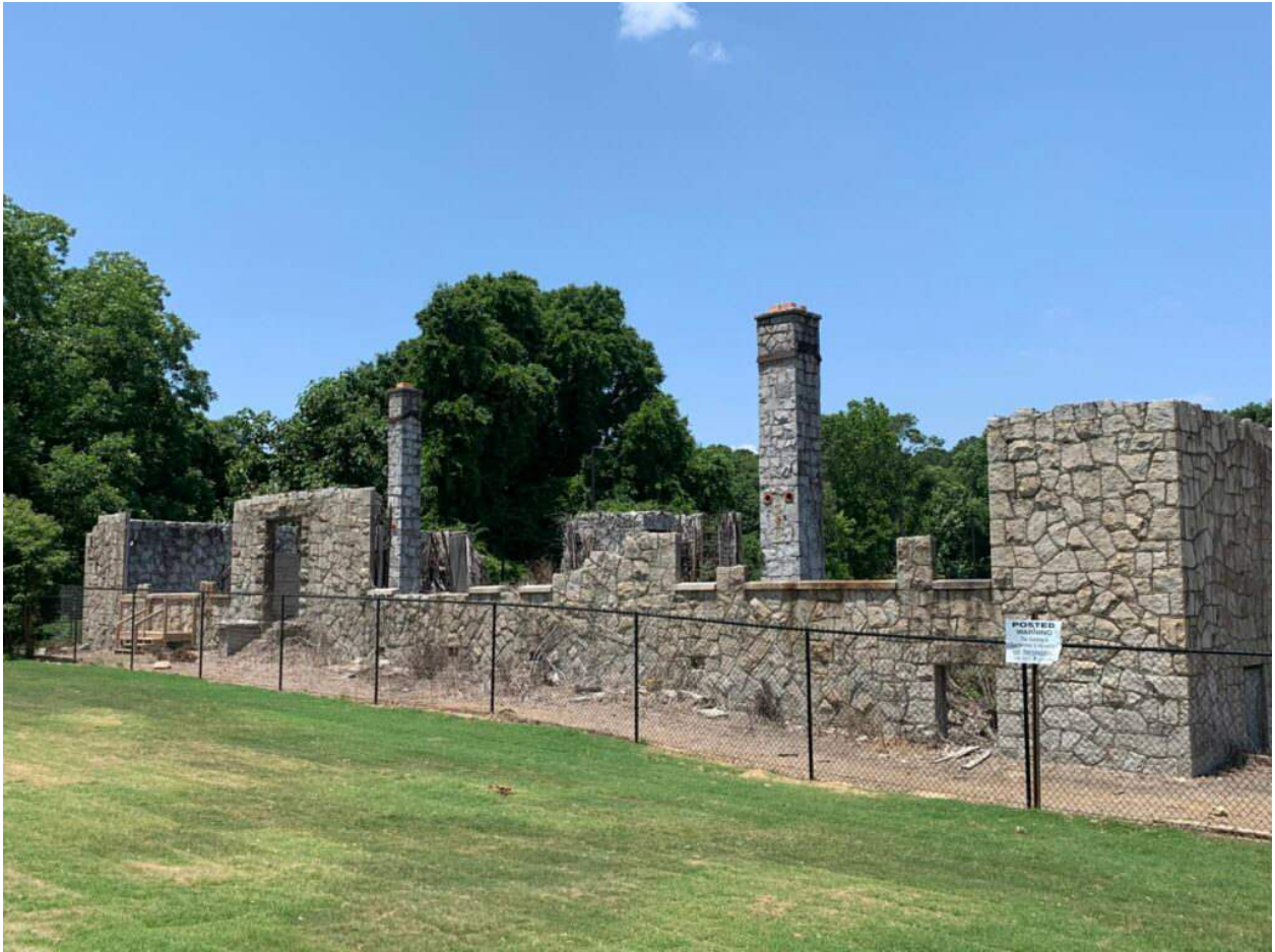
Above: The Bruce Street School ruins as they appear today.