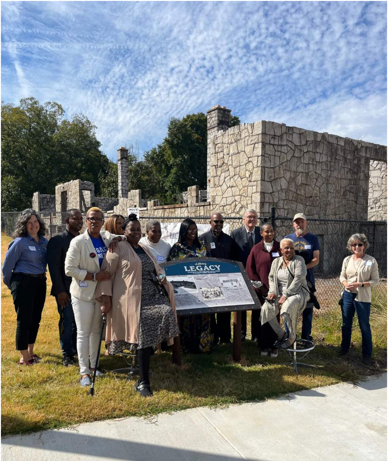
Above: A new historical sign in front of the old Bruce Street School that was unveiled in November 2022.