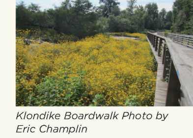
Klondike Boardwalk

G MOUNTAIN TOP TRAIL .05 Miles, Cairn Markings The iconic trail to the peak of Arabia Mountain. Accessed from the nature center by following the paved AMP trail and boardwalk or limited parking at the south parking lot. Keep your eye on the rock cairns to find your way and tread lightly on the bare rock to avoid sensitive plants. Follow the gradual rise to the peak and marvel that you're so close to Atlanta!