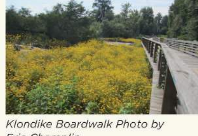
Klondike Boardwalk