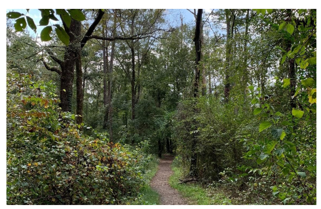
A trail in the Arabia Mountain National Heritage Area. Junior Ranger Ramble will guide participants through this nationally significant landscape.

Digital Event Connects Kids, Families with Nature & History