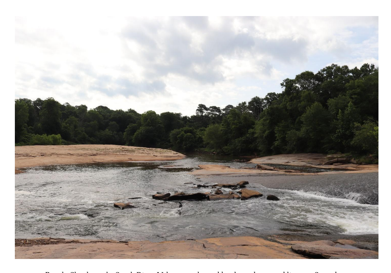
Panola Shoals on the South River. Volunteers cleaned banks and removed litter on Saturday.