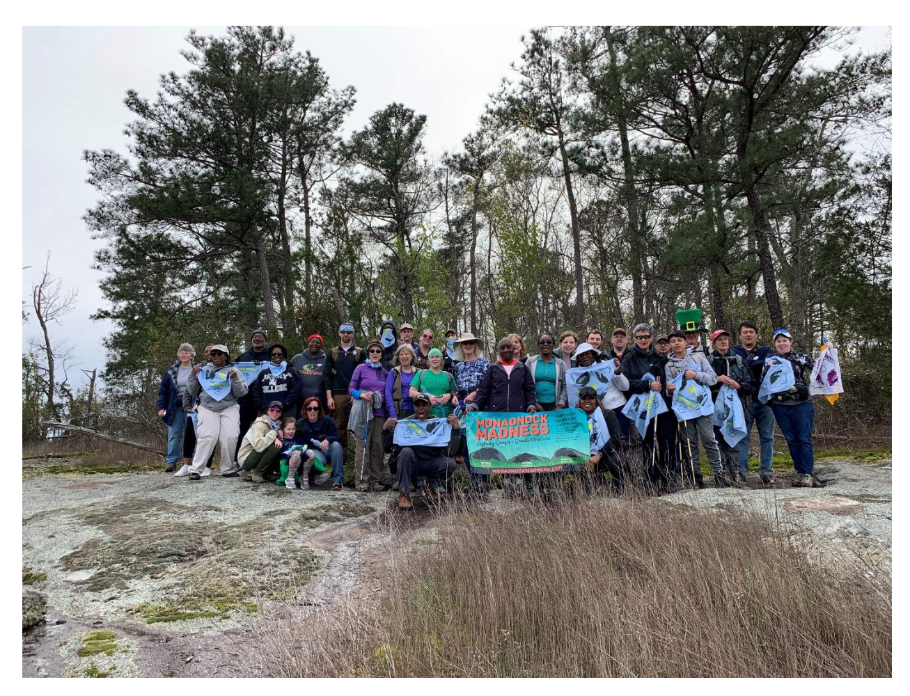
Triumphant triple hikers summit Panola Mountain with a guided Monadnock Madness hike.