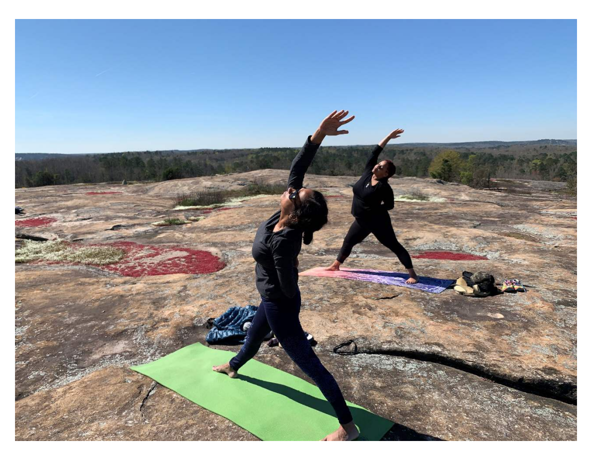
Each year, Monadnock Madness features a yoga class on top of Arabia Mountain.