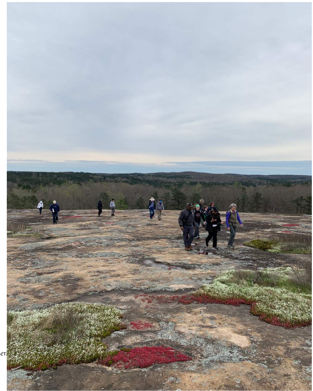
A group of hikers