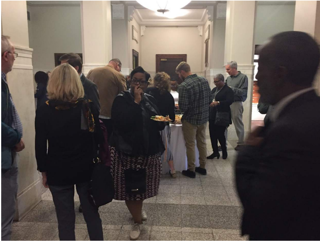
Attendees enjoy the opening reception for Deep Roots in DeKalb: The Flat Rock Story of Resilience at the DeKalb History Center