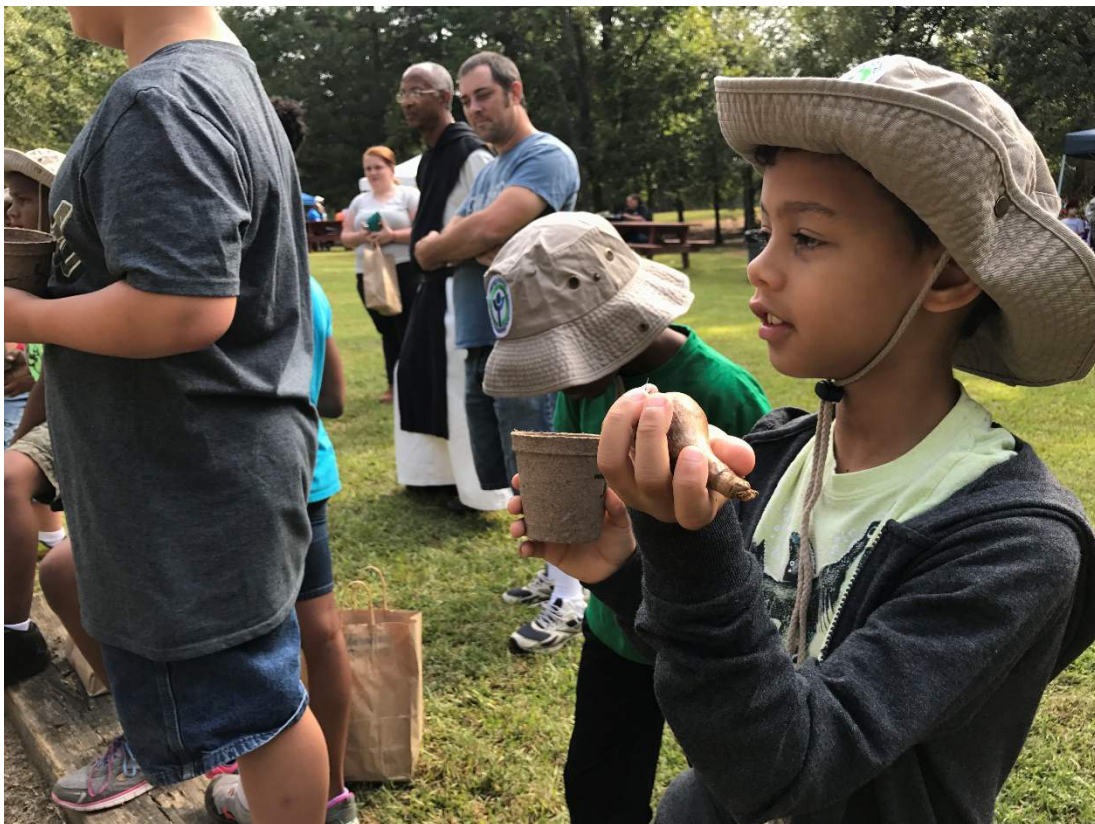
Get in the dirt with a hands-on planting workshop.