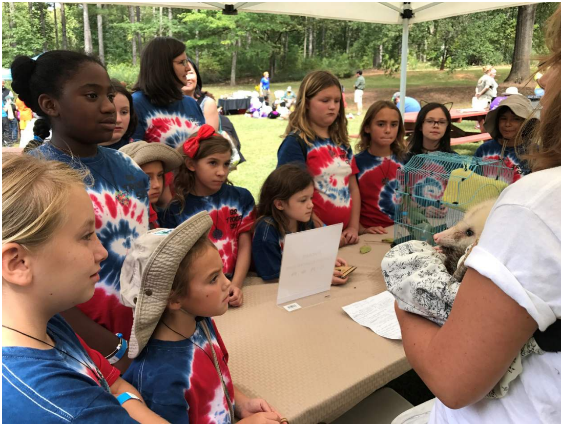
Kids will have the opportunity to learn about Georgia's native wildlife with volunteers from the Atlanta Wild Animal Rescue Effort (AWARE).