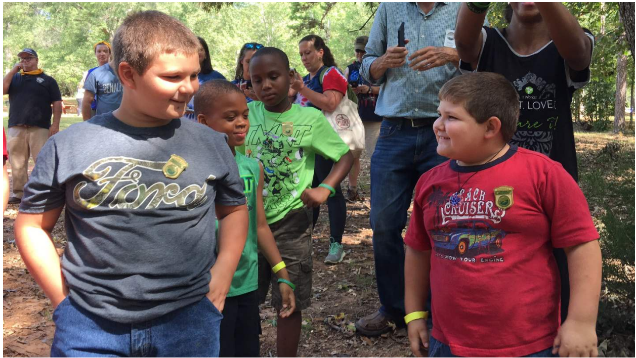
A group of newly-minted Junior Rangers proudly sport their badges at a previous Junior Ranger event. Junior Ranger Day ends with a hike and swearing-in at Arabia Mountain.