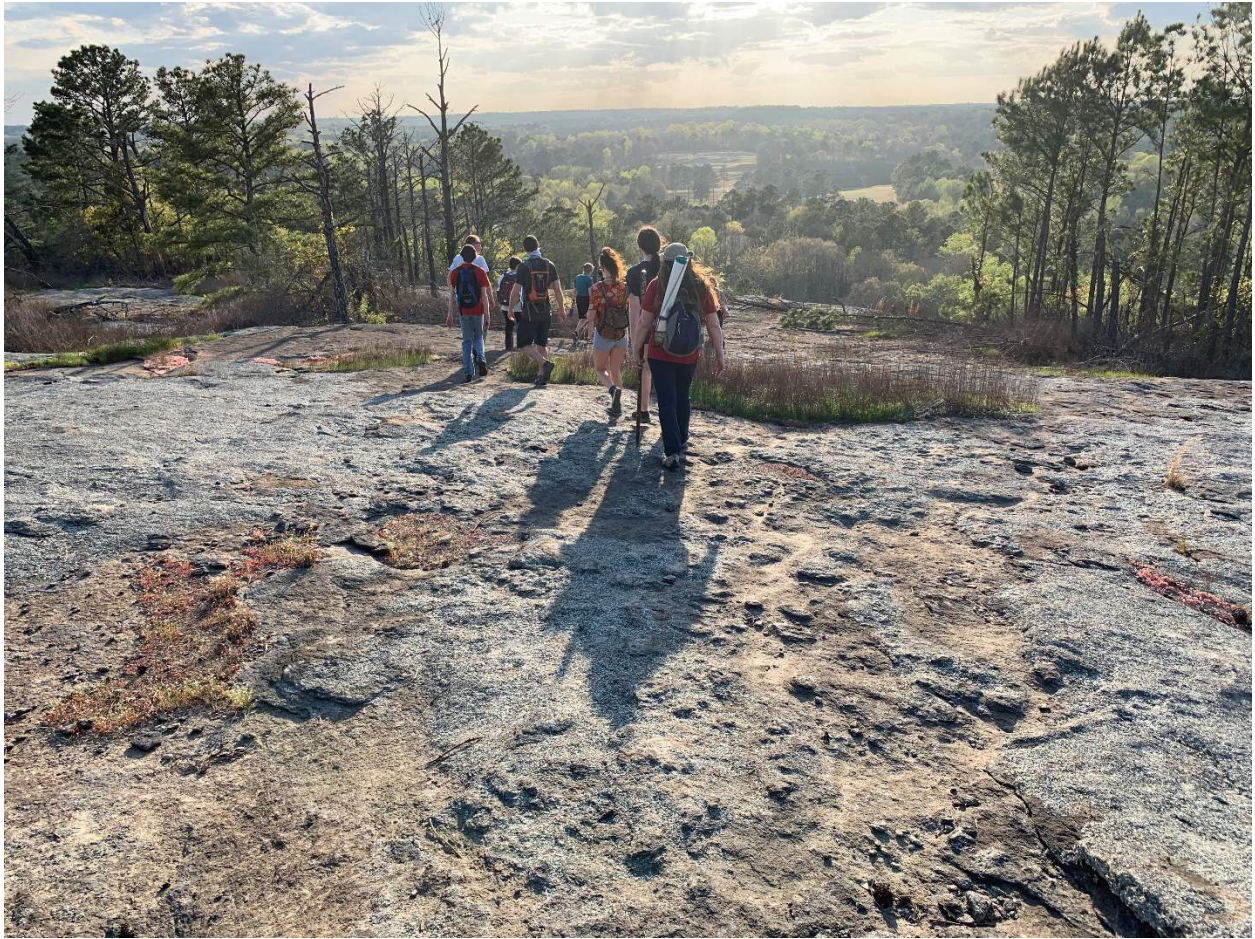
Above: Participants enjoy a guided hike on Panola Mountain in a previous year's Monadnock Madness. Part of Panola Mountain State Park, Panola Mountain is a National Natural Landmark and rare example of a pristine granite outcrop ecosystem.