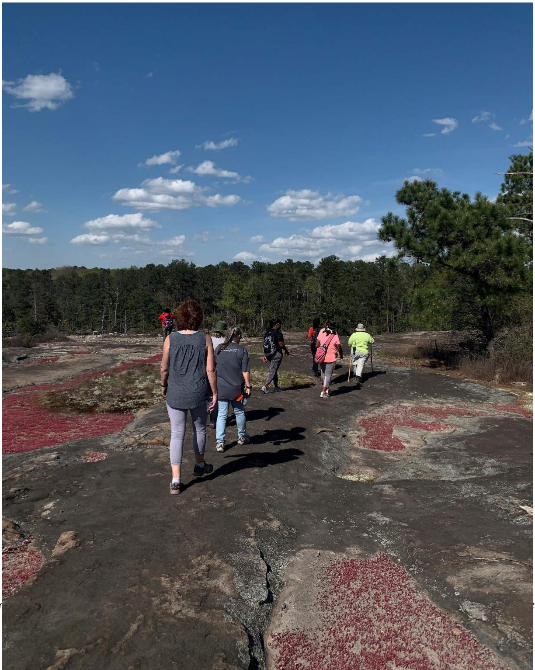
Above: Hikers on