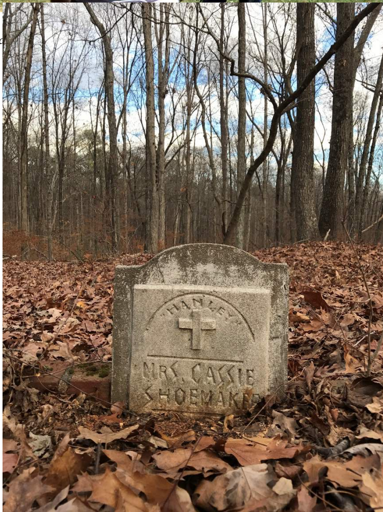
homestead. One of the is were enslaved.