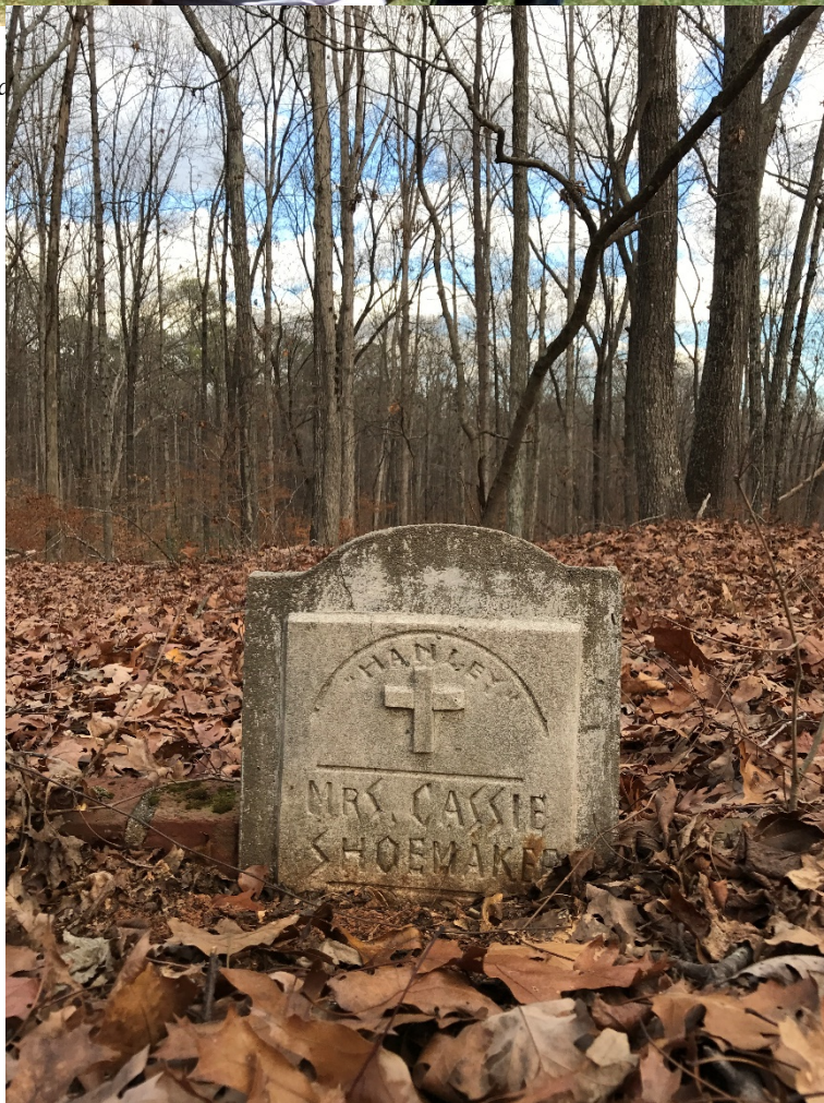
homestead. One of the is were enslaved.