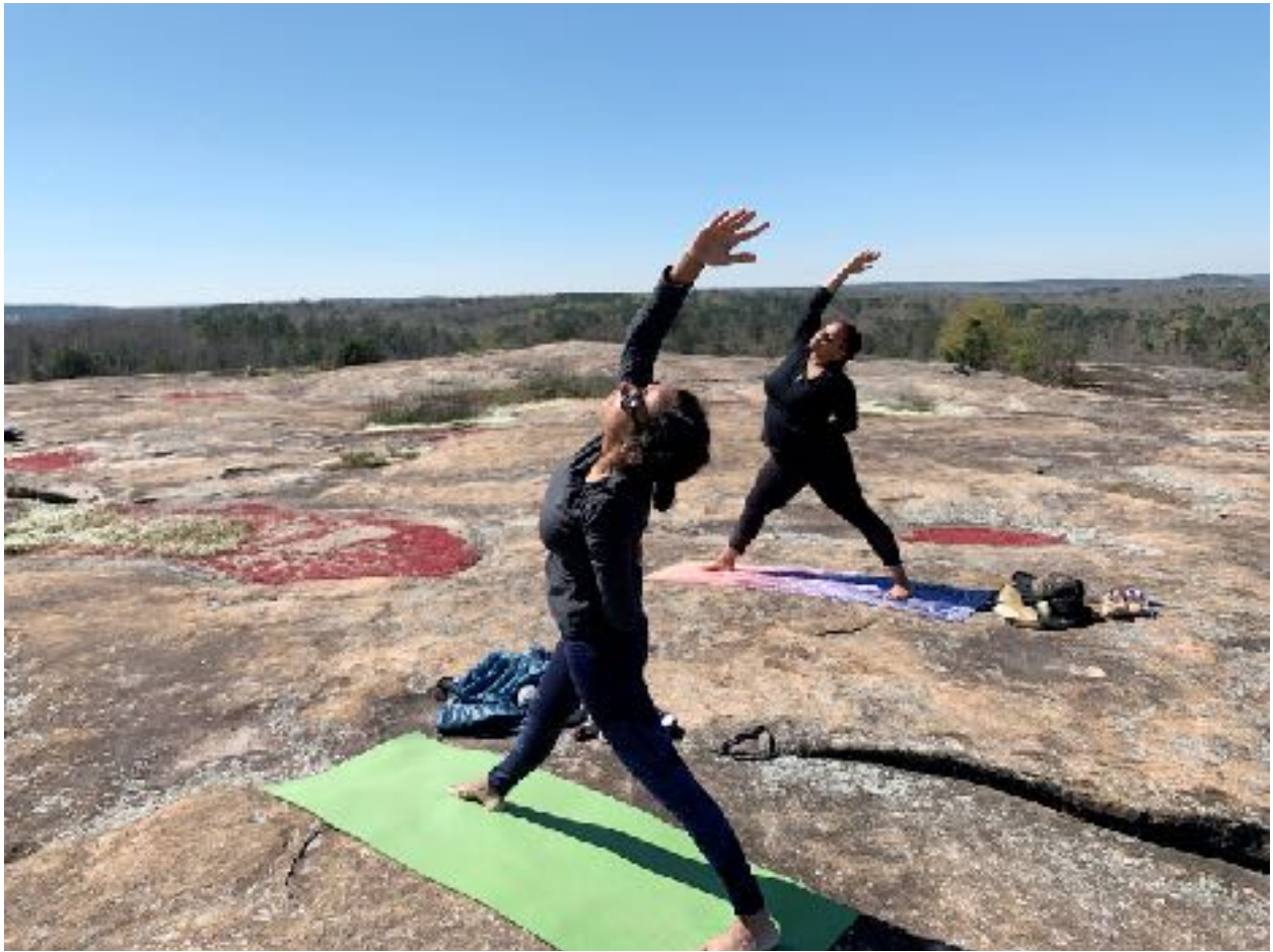
Mountaintop yoga is a popular event during Monadnock Madness, featuring a simple guided practice on top of Arabia Mountain. This year's yoga class will occur at sunset on March 29 th .