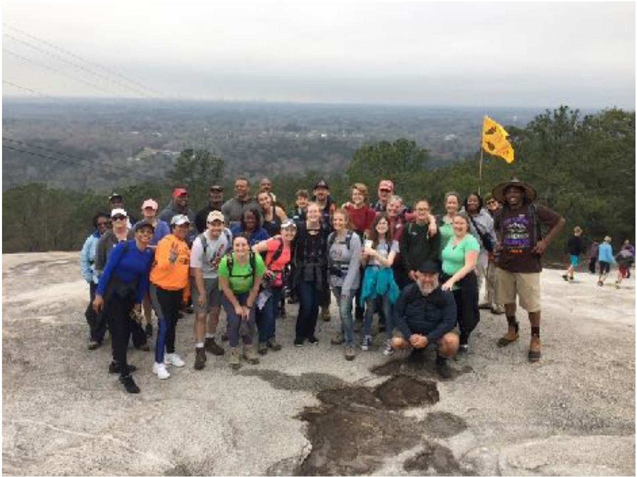
Monadnock Madness hikers during the Triple Hike Challenge at Stone Mountain.

All hikers will earn a commemorative souvenir after completing the Triple Hike Challenge, and an extra souvenir for taking the challenge a step farther and hiking Kennesaw Mountain. If you are interested in completing the challenge at your own pace, each park offers visitors the option to “hike as you like,” a self-guided tour of the monadnocks. Pick up a passport at one of the parks or online during the month of March. You can also earn a prize through the Monadnock Madness Geocaching Challenge , in which participants use a smartphone to find treasures hidden across the landscape. More information at monadnockmadness.com .