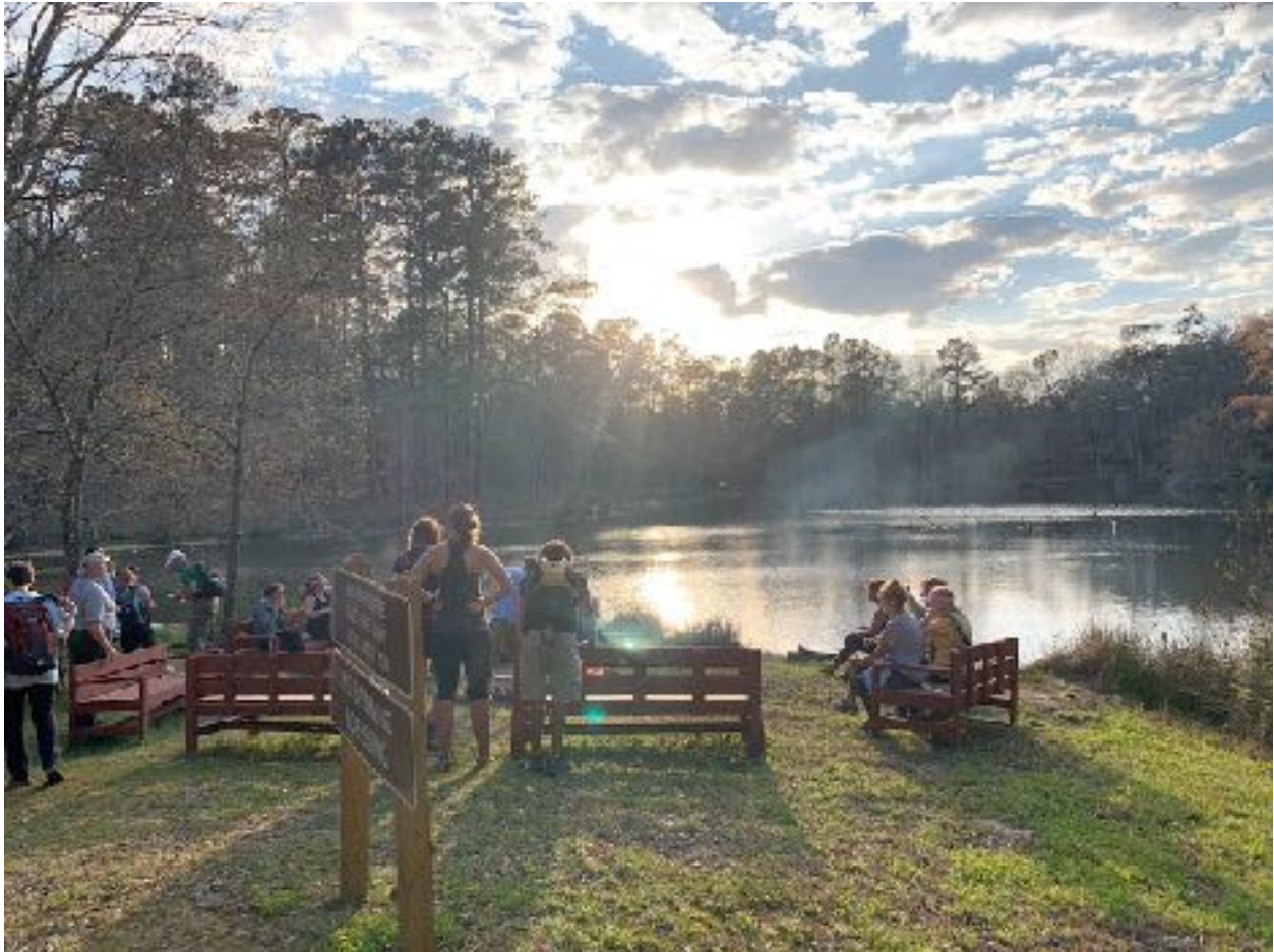
Following a long day of hiking, Guided Triple Hike participants enjoy s’mores at the base of Panola Mountain.