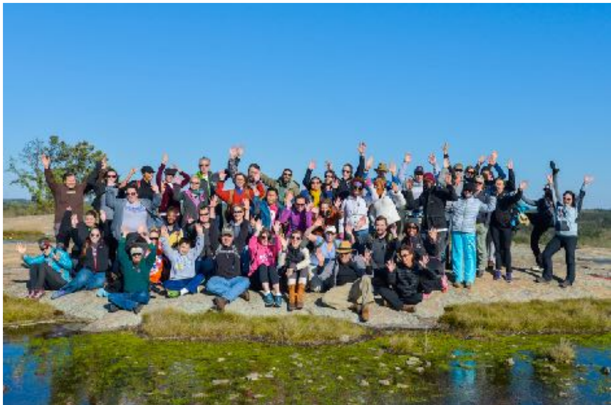
Hikers on top of Arabia Mountain, part two of the guided Triple Hike Challenge. The day starts at Stone Mountain before hiking Arabia and then Panola Mountain, ending with s’mores at the base of Panola.

STONECREST, Ga. – Are you ready to rock? This March, get out and explore Georgia’s granite giants – Arabia Mountain, Panola Mountain, Stone Mountain and, new to the event, Kennesaw Mountain – during the annual Monadnock Madness . Come celebrate these four major Atlanta-area monadnocks through hikes, workshops, classes and fitness throughout the month. That includes the ever-popular Triple Hike Challenge , in which hikers summit three granite mountains in a single day. For the first time, Kennesaw Mountain National Battlefield Park will join the event as a special “fourth mountain” option, allowing hikers to gain an extra prize. A celebration of nature, wildlife and some darn big rocks, Monadnock Madness will change how you see Atlanta’s wild places. Registration for triple hikes, photography workshops and mountaintop yoga opens on Jan. 21 st (Tuesday).