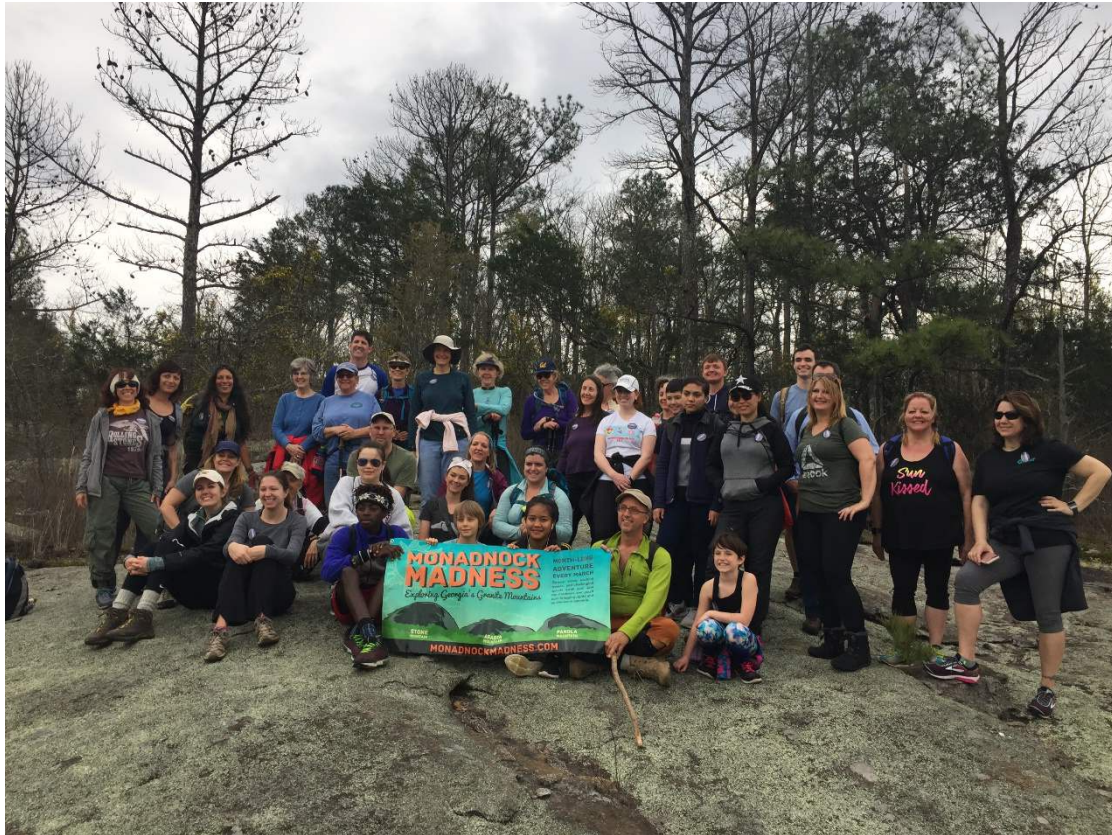
Hikers celebrating on top of Panola Mountain after completing a triple hike – summitting all three monadnocks in a single day.