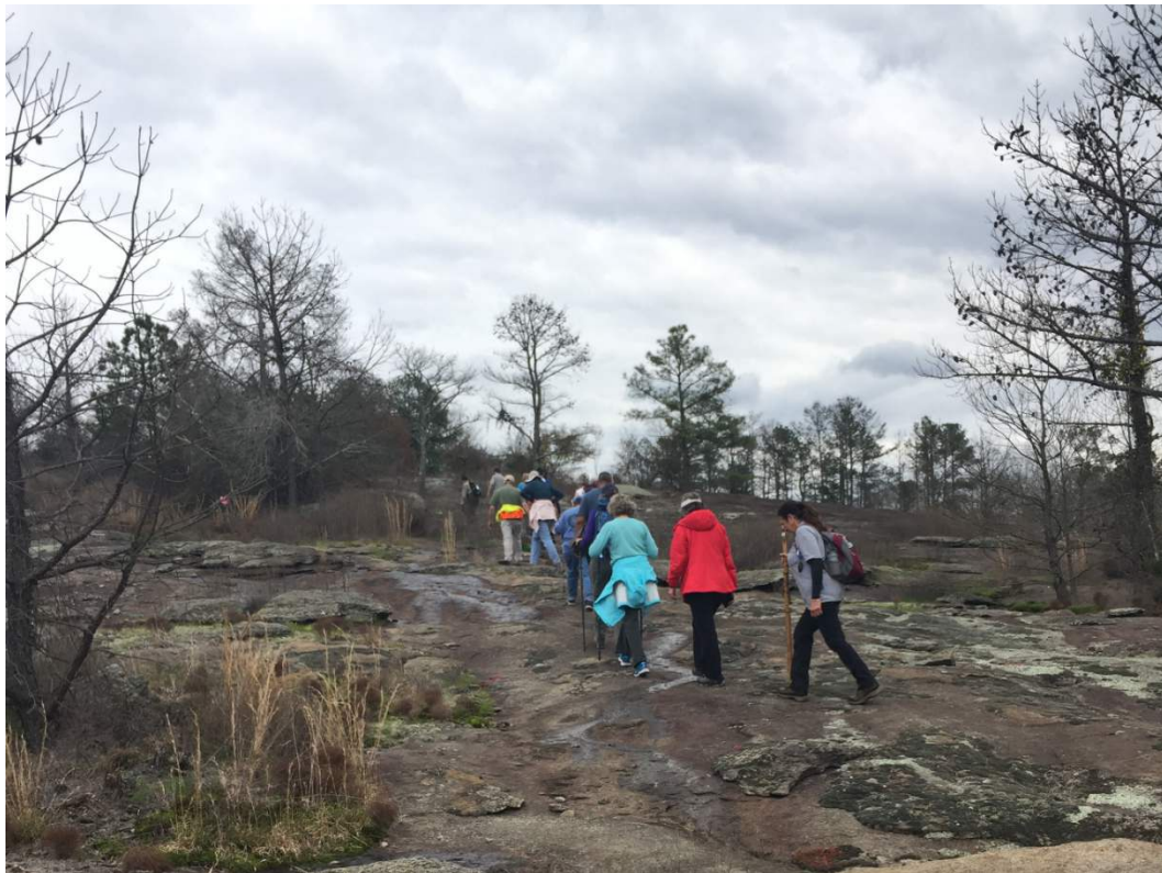
Hikers at Panola Mountain, experiencing the only of the three monadnocks to never be quarried, leaving a pristine ecosystem for all to enjoy.