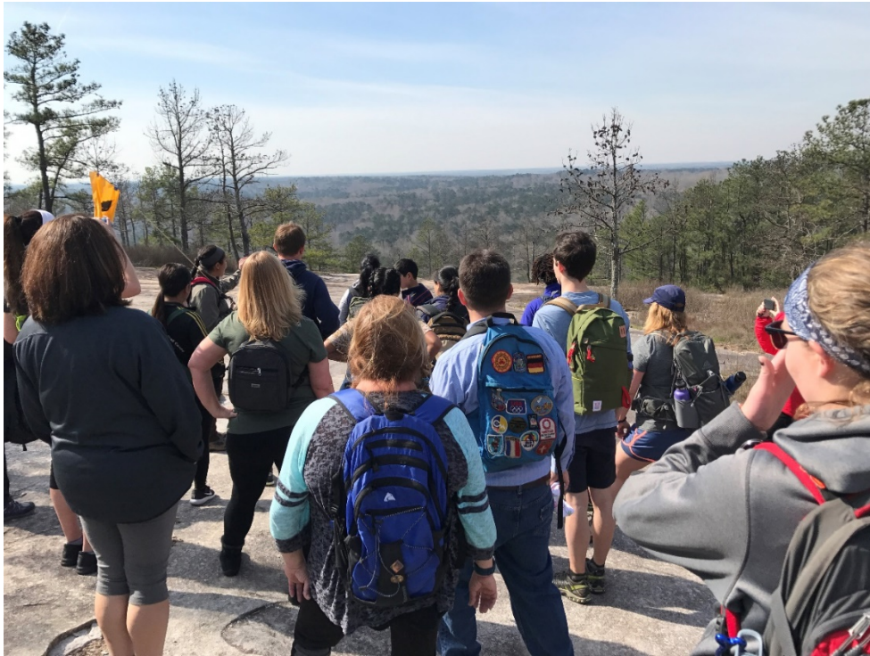
Monadnock Madness hikers during the Triple Hike Challenge at Stone Mountain.

All hikers will earn a commemorative souvenir after completing the Triple Hike Challenge. If you are interested in completing the challenge at your own pace, each park offers visitors the option to “hike as you like,” a self-guided tour of the three monadnocks. Pick up a passport at one of the parks or online at monadnockmadness.com during the month of March.