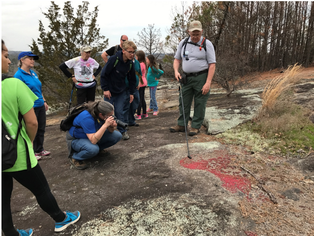
Monadnock Madness hikers getting a glimpse of diamorpha on the pristine granite outcrop at Panola Mountain.