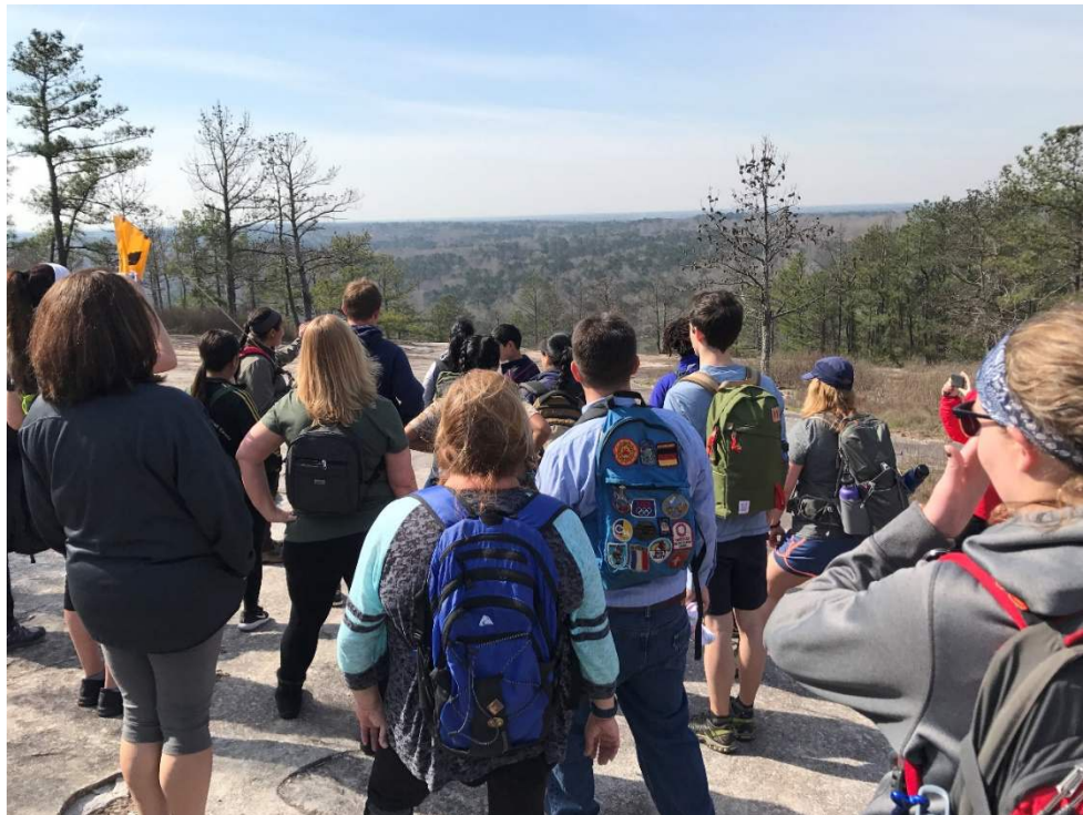
Monadnock Madness hikers during the Triple Hike Challenge at Stone Mountain.

All hikers will earn a commemorative souvenir after completing the Triple Hike Challenge. If you are interested in completing the challenge at your own pace, each park offers visitors the option to “hike as you like,” a self-guided tour of the three monadnocks. Pick up a passport at one of the parks or online at monadnockmadness.com during the month of March.