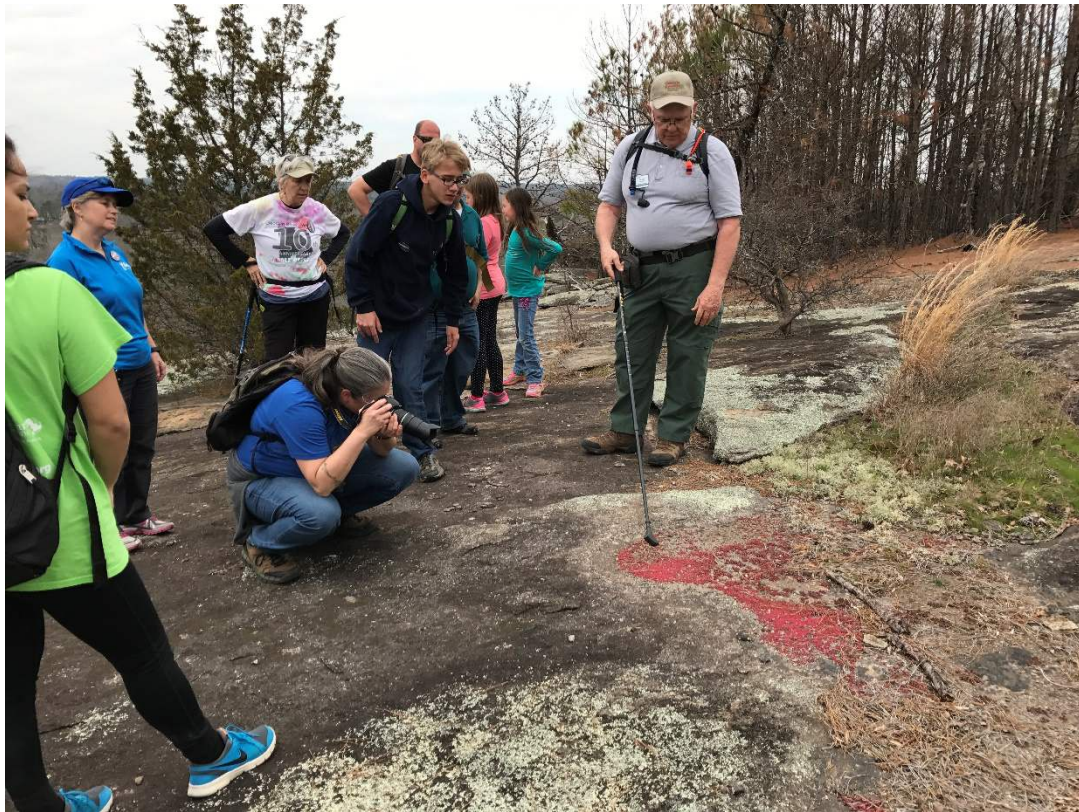
Monadnock Madness hikers getting a glimpse of diamorpha on the pristine granite outcrop at Panola Mountain.