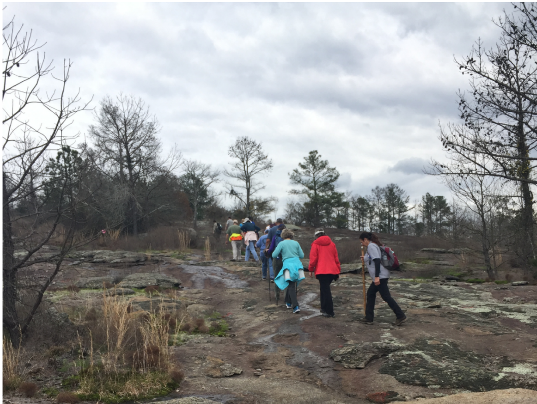
Hikers at Panola Mountain, experiencing the only of the three monadnocks to never be quarried, leaving a pristine ecosystem for all to enjoy.