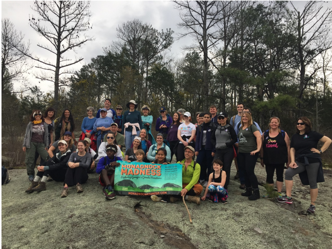
Hikers celebrating on top of Panola Mountain after completing a triple hike – summitting all three monadnocks in a single day.