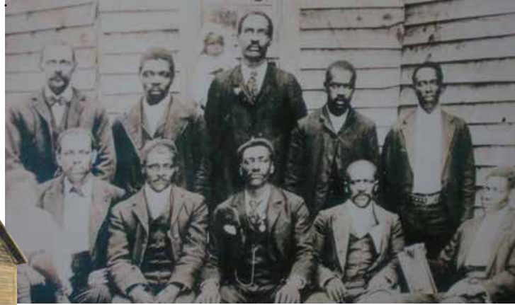
The founders of the Flat Rock community in a photograph c. 1890. Notable decedents include football greats Warren Moon & Willie Gault and comedian Chris Tucker.

Flat Rock Archives @ 3979 Crossvale Road, Lithonia 30038 Open T, Th & Sat 10am-4pm www.flatrockarchives.org