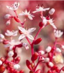
The succulent called diamorpha blankets the mountain with a red carpet in early spring before small white blooms pop.