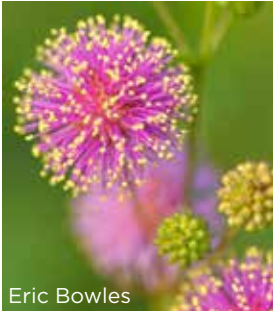
Eric Bowles The "sensitive fern" is one of the many flowers found on the granite outcrops.

Nature Center & Mountain Access @ 3787 Klondike Road, Lithonia 30038 Mountain Base @ 4158 Klondike Road, Lithonia 30038 Open Daily: Dawn to Dusk