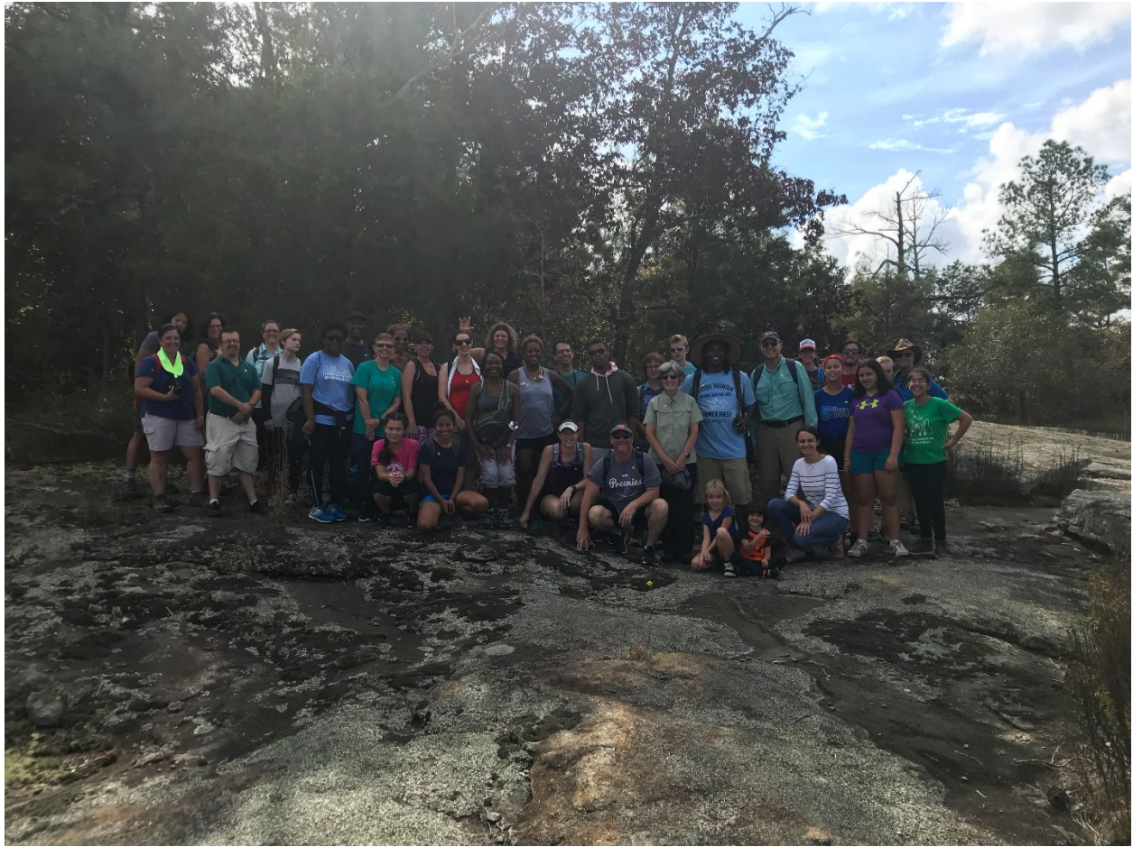
Hikers complete the Daisy Days Triple Hike at Panola Mountain, a National Natural Landmark and carefully conserved granite outcrop ecosystem.