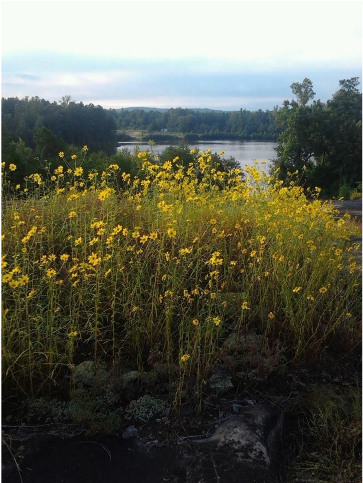
Yellow Daisies blossoming at Arabia Mountain, one of three mountains on the Daisy Days Triple Hike.